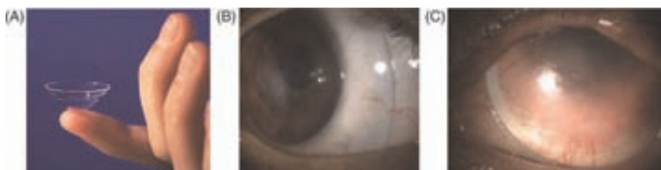
Figure (A) Scleral lens; (B) PROSE in Keratoconus eye; (C) PROSE in SJS eye.

Sjögren's syndrome; history of LASIK or other refractive surgeries; limbal stem cell deficiency; Stevens-Johnson syndrome (SJS)/toxic epidermal necrolysis syndrome (TENS); aniridia, cicatricial conjunctivitis/ocular