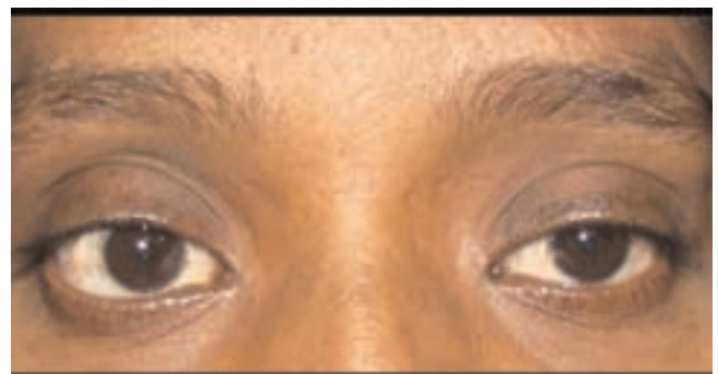
Figure 3. Left eye - mild ptosis.