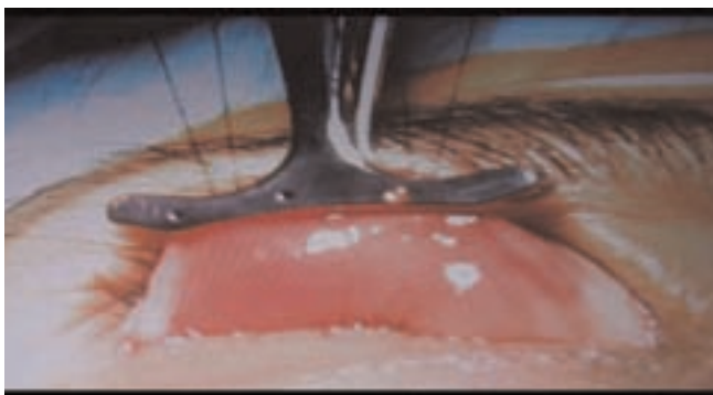
Figure 5. The T shaped- Putterman clamp grasping a pre-determined amount of Muller's muscle and conjunctiva.

Local infiltration was administered over the everted upper eyelid using 0.5 ml of 2 percent lidocaine and 0.5 percent bupivacaine solution with 1:100,000 units of epinephrine. A 4-0 silk suture traction suture was passed at the central lid margin, to evert the lid over a Desmarres's retractor. A unipolar radiofrequency cautery was used to mark half the distance (4mm) of desired resection (8mm) from the upper border of the tarsus toward the superior fornix. 6-0 silk suture was passed horizontally through conjunctiva and Mullers muscle in three passes along these marks. The silk sutures were elevated equally and a Putterman's Mullerectomy clamp was placed to incorporate Muller's muscle and conjunctiva (Figure 5). A 5-0 prolene suture was passed from lateral to medial through conjunctiva and Muller's muscle 1.5 mm below the clamp in a serpentine fashion. Both ends of the suture were externalized through opposite ends to tie on the skin. A 15 number blade was used to excise the conjunctiva and Muller's muscle (Figure 6). Prolene suture ends were tied on the skin. Haemostasis was achieved. Antibiotic ointment was applied Postoperatively patient was advised to start ice compressions 10 minutes every waking hour for first 48 hours then to start warm compresses 3 times a day for 2 weeks. Patient was started on tear supplements and analgesic medications. Prolene sutures were removed after 7 days. Postoperatively, patient achieved the desired