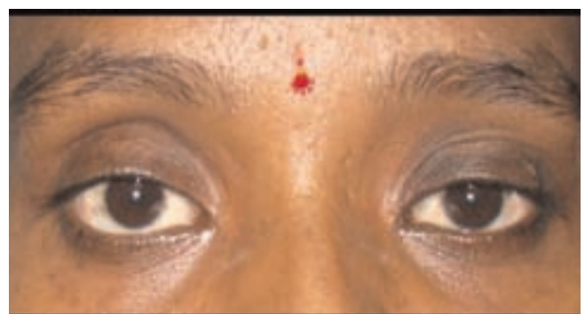
Figure 4. Left eye- Good ptosis correction following Conjunctival Mullerectomy.