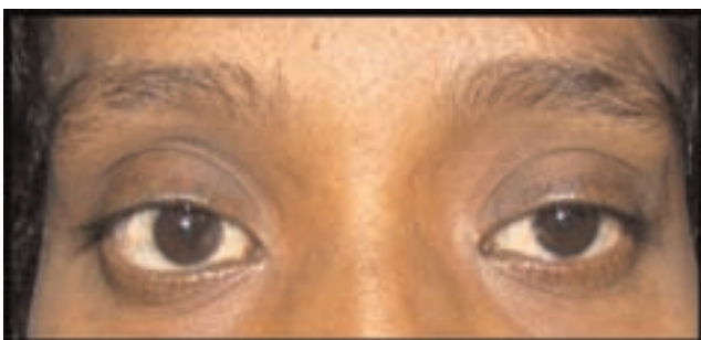
Figure 1. Left eye- mild ptosis